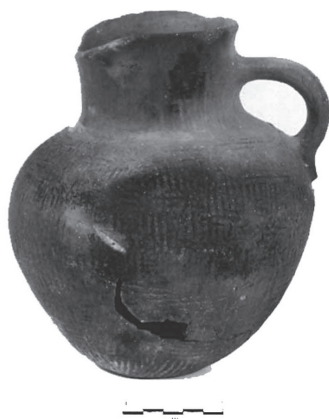
3. Examples of “cerámica criolla” or “colono ware” combining European and American Indian elements. Top: Sixteenth century red and cream polychrome indo-hispano wares, Concepción de la Vega, Dominican Republic. Bottom: Late seventeenth century cross-simple stamped pitcher form, St. Augustine, Florida (Florida Museum of Natural History, University of Florida).

The specific physical attributes of such pottery vary by region, but whether made by Spanish criollos , Africans, Indians or mixed-race people, these local ceramic traditions share the characteristics of being: