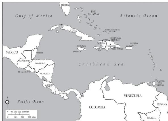
1. Map of the Caribbean region showing Caribbean Spanish colonial sites.

The town was occupied from about 1500 to 1562, when it was destroyed by an earthquake (Kulstad, 2008; Ortega y Fondeur, 1978). Santo Domingo, which has been the Dominican capitol since 1502, has also been studied extensively by archaeologists (Council, 1976; Garcia Arévalo, 1978, 1990; Ortega, 1978; Ortega y Fondeur, 1979; Veloz-Maggiolo and Ortega, 1992) (fig. 1).